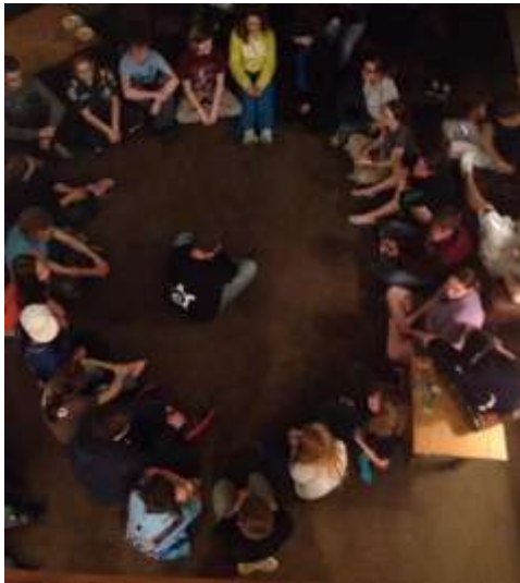
"Duck... Duck... Duck..."

We know you can do better than this caption. Send in your caption, name, and council you are from to vp-communications@crventuring.org . If you win, your caption will be featured in next month's newsletter and on our Facebook page. Check back next month to see who wins.