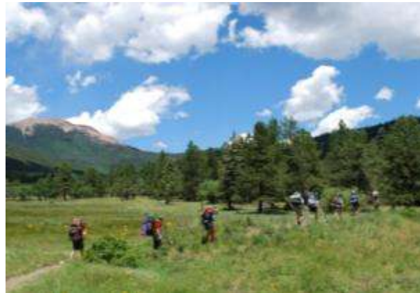
"I knew we should've taken that left turn at Albuquerque."