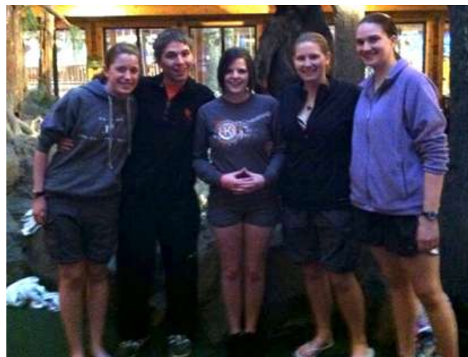
Area and Region at the Central Region SPLASH

If you have ever heard me talk/write about Venturing, I always talk about loving the program for all of the opportunities it provides—this event was one opportunity I'm glad I didn't miss! Thank you to everyone that joined us, and the Central Region team for putting this once in a lifetime event together! Hope to see you again soon!