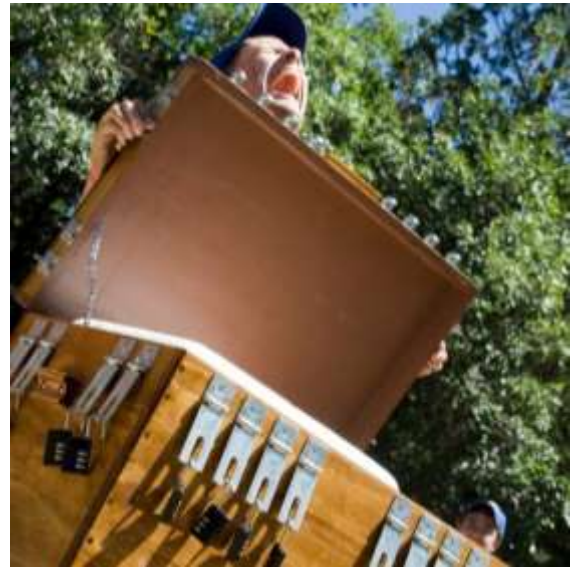
“I finally found where all the advisors were hiding all this time!”