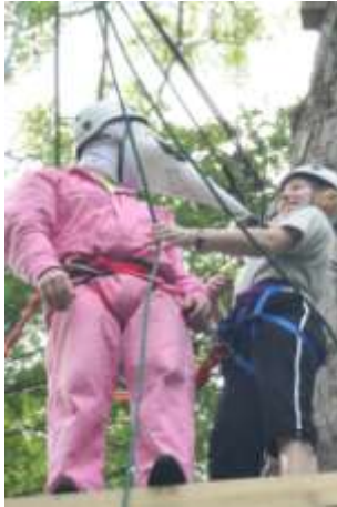
“What do you mean you’ve never pushed someone like me out of a tree before?”

We know you can do better than this caption. Send in your caption, name, and council you are from to vp-communications@crventuring.org . If you win, your caption will be featured in next month’s newsletter and on our Facebook page. Check back next month to see who wins.