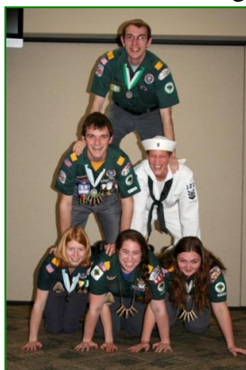
Area 3 Venturing V.O.A. Supporting Our Central Region Venturing President