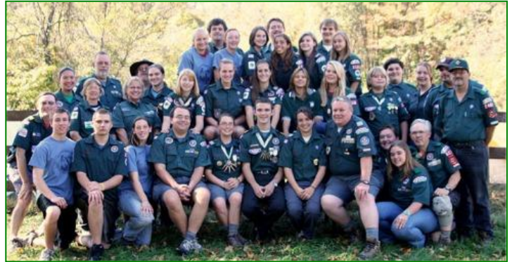
2010-2011 GSLAC Council & District VOA Officers and Advisors