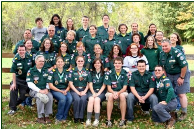
GSLAC Council & District VOA Officers and Advisors