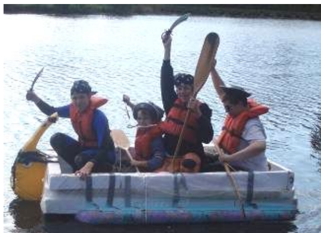
Pirates from Crew 1932 from Greater Cleveland Council in their 1 st place vessel.

All hands were truly on deck with the amount of fellowship and promotion of the Venturing program. Area 4 is looking forward to seeing all of you next year at the 2 nd annual Area event. Next year will be just as ship-shaped with the all the help for scurvy sea dogs.