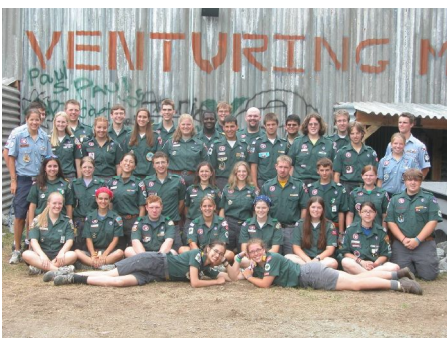
Venturing & Sea Scout Exhibit Youth Staff at the 2005 National Scout Jamboree

Venturers may attend the Jamboree as staff if they meet the age requirements. Jamboree staff positions are open to adult men and women who meet required qualifications. Adult staff members must have been born before July 26, 1989. Youth staff members must have been born between August 4, 1989 and July 26, 1994, and be registered members of the Boy Scouts of America. Jamboree staff applicants are submitted online directly to the national office. Youth staff (under age 18) have the opportunity to serve in numerous job assignments at the jamboree. Youth staff will be needed in many of the jamboree groups and services listed on the staff application, such as jamboree band (Daily Ceremonies), Trading Posts, Brownsea Island, Action Centers, and Service Corps. There are many program areas in which to staff but there is a Venturing and Sea Scouting booth to consider! More information and applications are available on www.crventuring.org .