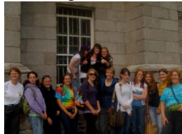
The Crew outside Trinity College with our new friends from the 5th Port Dollymount Girl Sea Scouts.