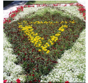
Venturing symbol in the Villa Philmonte garden

Friday wrapped up the week of learning with more informational sessions and graduation ceremonies. Through all of the educational aims of the week, classes were not the only draw of PTC. Faculty, participants, and the Cabinet also participated in evening entertainment like a Tobasco Donkeys concert, Western night, sunrise hikes to Lover's Leap, and touring around the town of Cimarron, NM.