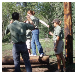
Cabinet on a low COPE course element

The Cabinet spent time with classes on Monday and Tuesday including some teambuilding through a low COPE course. Wednesday was the day off from classes during which time the participants enjoyed the Philmont scenery with their families. Thursday and