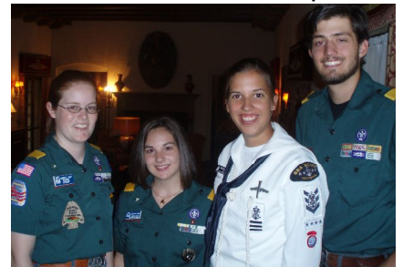
Cabinet in the Villa Philmonte

Philmont is home to the Philmont Museum and Seton Memorial Library in addition to the Villa Philmonte. Both historical tributes were open to PTC faculty and participants. The National Cabinet took the opportunity to visit both during Venturing week and learned a great deal about the origins of Philmont Scout Ranch.