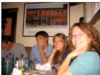
National Venturing Youth Cabinet out to dinner

Venturing Week at Philmont Training Center (PTC) was held from July 22 nd -27 th this year. Staff for the week arrived on Sunday to set up for a week of exciting events and great training and learning opportunities.